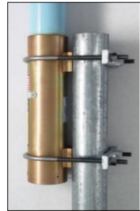
ANTC485 Typical Installation