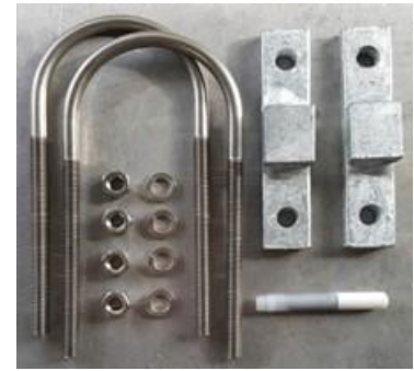
ANTC485 Clamp Kit