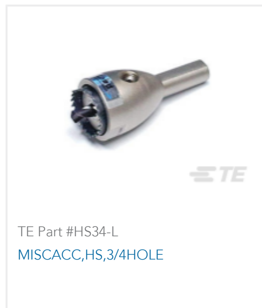
TE Part #HS34-L MISCACC,HS,3/4HOLE