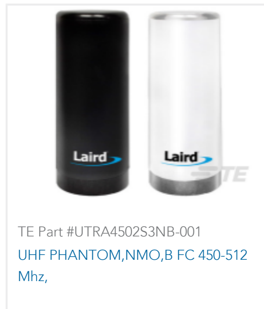
TE Part #UTRA4502S3NB-001 UHF PHANTOM,NMO,B FC 450-512 Mhz,