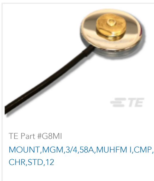
TE Part #G8MI MOUNT,MGM,3/4,58A,MUHFM I,CMP, CHR,STD,12