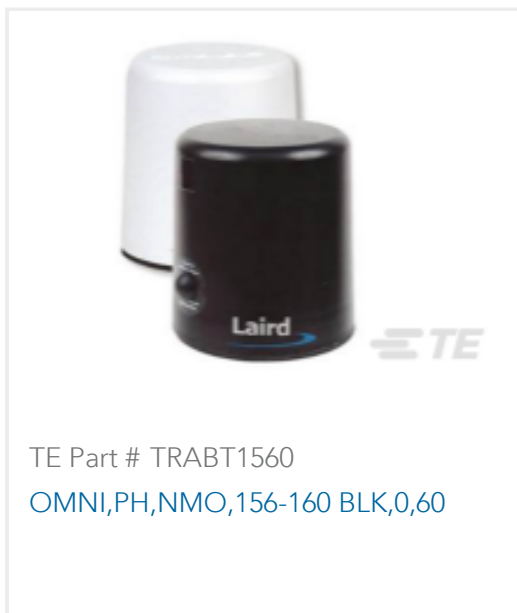
TE Part # TRABT1560 OMNI,PH,NMO,156-160 BLK,0,60