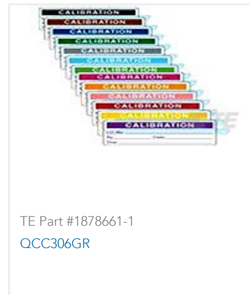
TE Part #1878661-1 QCC306GR