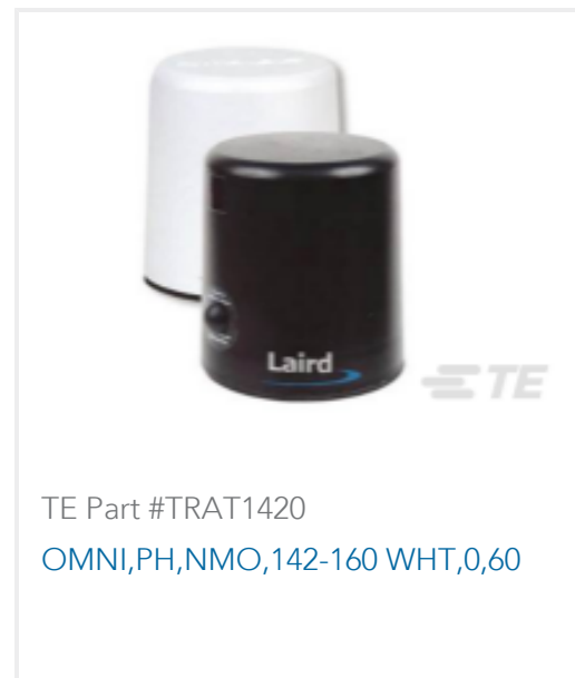
TE Part #TRAT1420 OMNI,PH,NMO,142-160 WHT,0,60