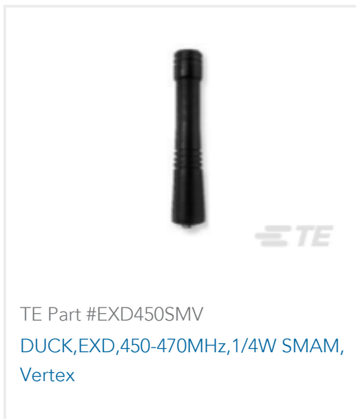
TE Part #EXD450SMV DUCK,EXD,450-470MHz,1/4W SMAM, Vertex