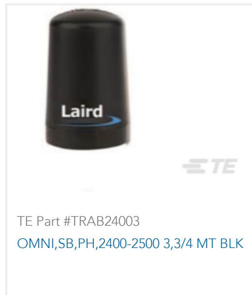
TE Part #TRAB24003 OMNI,SB,PH,2400-2500 3,3/4 MT BLK