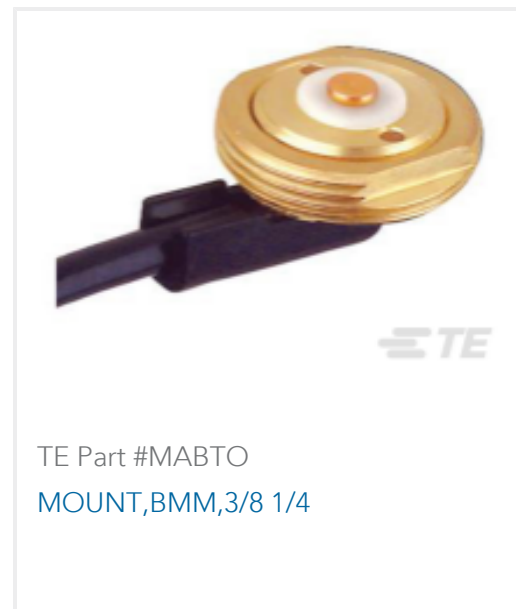
TE Part #MABTO MOUNT,BMM,3/8 1/4