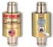
FM2 Mounting Kit (sold separately)

Laird Connectivity's fiberglass base station antennas are collinear designs enclosed in a high-density fiberglass, which is covered with a protective ultraviolet inhibiting coating.