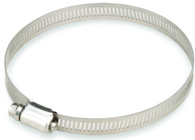
Round Member Adapter for 2–3 in round members