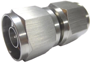
Type N Male to Type N Male Low-PIM Adapter