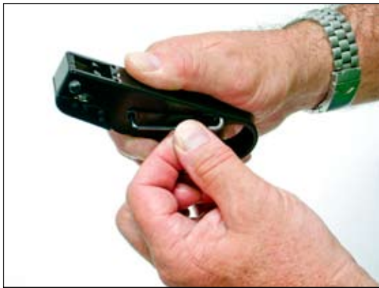
Easily remove self-stored wrench.