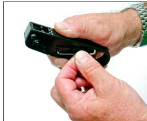
Give it a twirl!