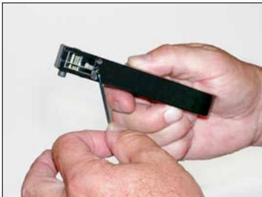
Adjust to meet your stripping dimensions.