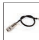
8-pin microphone adapter EDS-8