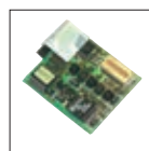
Digital modulation unit EJ-47U