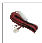
DC cable UA38Y UA-0038Y