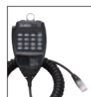
DTMF Microphone EMS-79