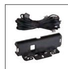
Control head separation kit EDS-30