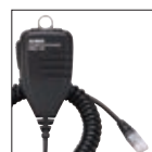
Plain Microphone (EMS78 or EMS79 depending on version) EMS-78